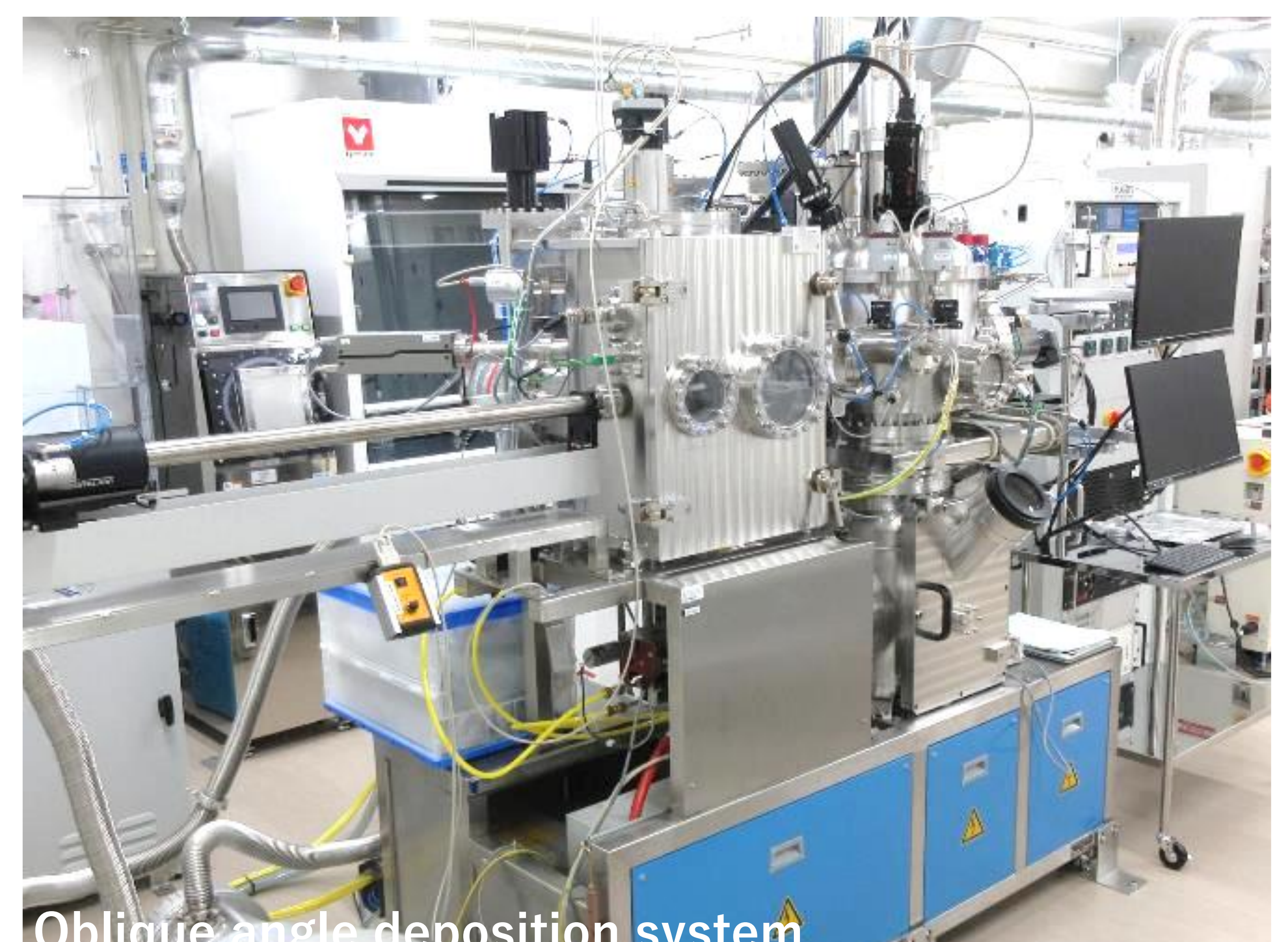
Oblique angle deposition system