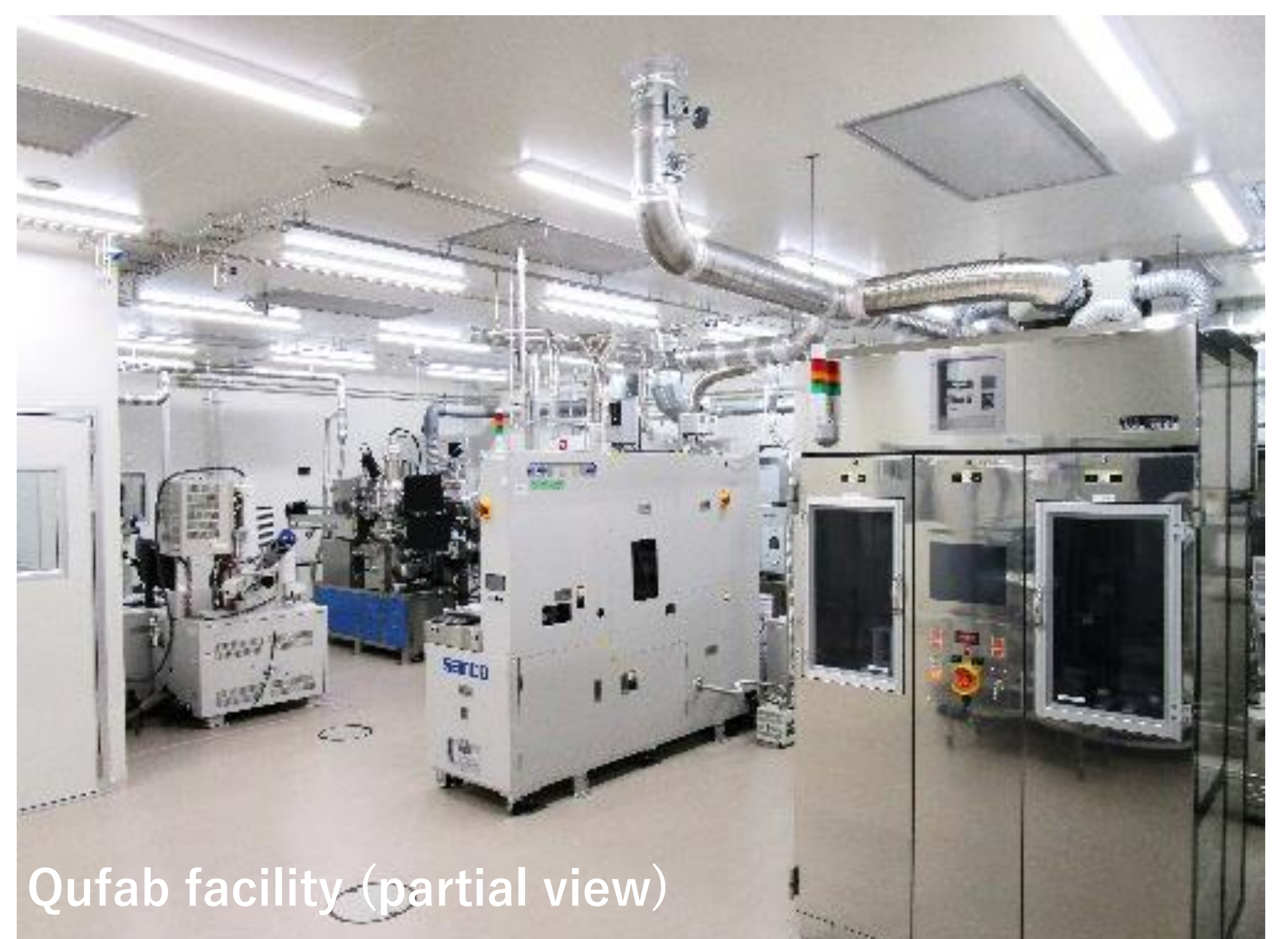
Qufab facility (partial view)